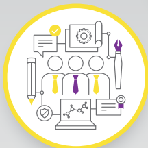
Specialized Service Industry