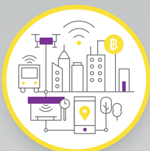
Smart City Development