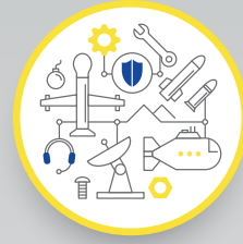
National defence Industry