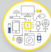
Electronic and Electrical Appliance Industry