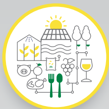
Agricultural and Food Processing Industry