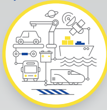
Motor Vehicle Industry