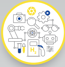
Machine Industry and parts